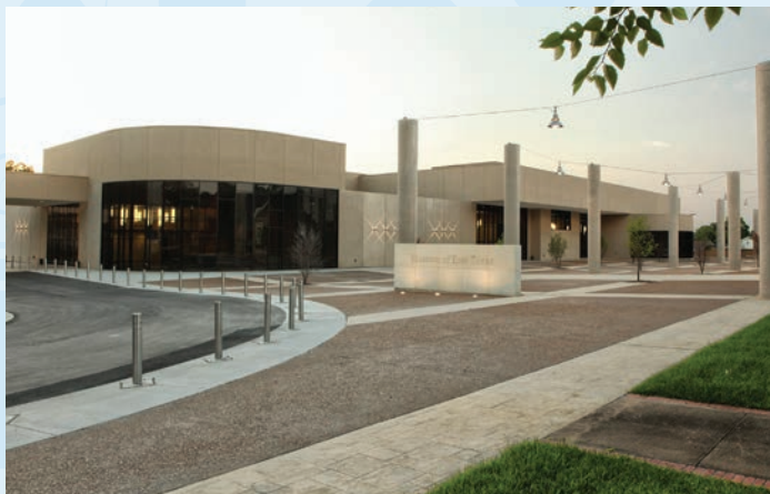
The newly renovated Pitser Garrison Convention Center has more than 54,000 square feet of exhibit space.

Hundreds of convention attendees travel to Lufkin each year. We also host military and family reunions, corporate meetings, state and national association meetings, and we're one of the best sports destinations in the state! Lufkin has 19 meeting facilities, 1,160 hotel rooms, 88 restaurants, unique shopping and family-friendly outdoor recreation. The Lufkin CVB's one-on-one convention assistance makes it simple and easy to find the best accommodations and facilities to fit your needs.