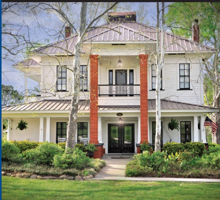
Mansion on Sawmill Lake