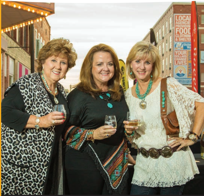
Downtown Lufkin hosts a variety of elegant events each year, including Lufkin's Bistro in October and Corks & Forks in February.